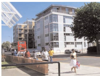
The Galleria Studios, Sumner Road, Peckham.