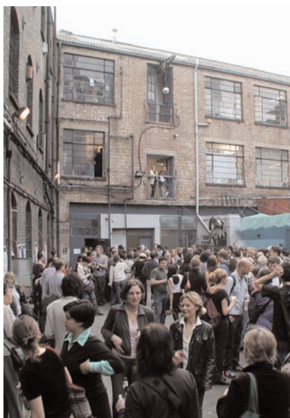
Courtyard, Bow Arts Trust, Open Studios night.