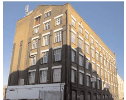
Mother Studios, Hackney.