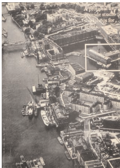
A proposal to provide studio workshops for artists. SPACE leaflet, 1967, a proposal to occupy part of a warehouse at St Katharine Dock.

SPACE Studios is the original London studio organisation. Established in 1967, SPACE currently manages 16 buildings providing affordable studios for over 500 artists. SPACE Programmes includes professional development for artists, off-site collaborations involving local communities, exhibitions at the Triangle and SPACE Media Arts, which offers media software courses and individual surgery advice. SPACE Media Arts also runs a flagship programme of projects and research engaging artists with emergent technologies.