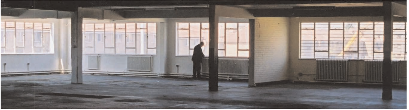
Above: ASC's New Cross Studios prior to development.