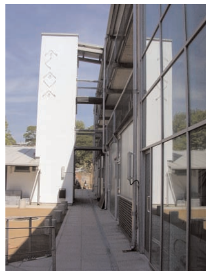
ACAVA's Blechynden Street Studios, North Kensington.

The report concludes that the affordable sector's provision of studios to visual artists creates a very significant subsidy to the visual arts sector in London and represents extremely good value for money.