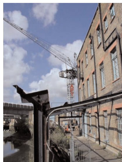
APT's studios, Deptford.