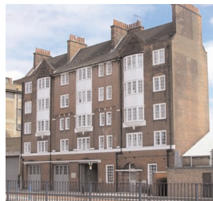
Acme Studios' work/live Fire Station building in Poplar.

In addition to Acme's 50 studios, the project includes 98 apartments and four live/work units. Twenty-three of the apartments are for social housing, both for rent and shared ownership.