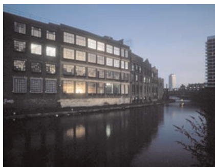
Acme's Copperfield Road building on the Grand Union Canal.