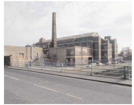
Acme Studios' Carpenters Road studios. Established in 1985 and proving 140 affordable studios, the building was demolished to make way for the 2012 Olympics.

If we value art, we must value artists. Ensuring there are appropriate, secure facilities for the long term means artists can continue to make work and contribute to a creative and vibrant city for the benefit of all.