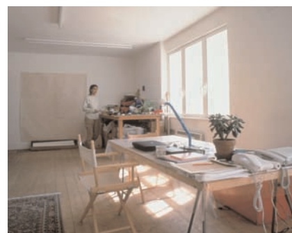
Perminder Kaur in her Fire Station work/live unit.