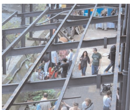
APT Open Studios weekend. Photo: Liz May