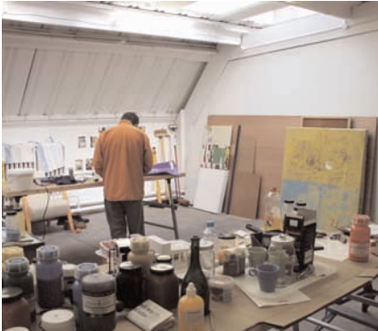
Artist in ASC's New Cross Studios.

ASC (Artists Studios Company) is a registered charity that exists to support artists, promote art and advance the education of the public in the arts. ASC is a leading affordable workspace provider currently supporting over 400 artists in seven leasehold buildings across south and east London.